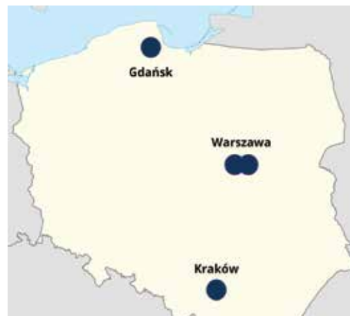
The new Presbytery in Poland has a church in the city of Kraków, Gdańsk, and two in Warsaw

At present, the Polish Church has six ministry candidates. I like to say that we have more pastoral candidates than we have churches for them. This means they will need to go out and plant new churches. Ideally, we would want a church in every major city of the country so that driving to the nearest Presbyterian church would never have to take longer than two hours.