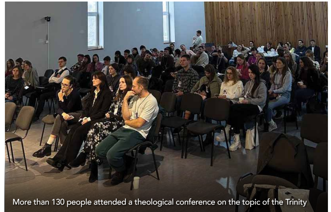
More than 130 people attended a theological conference on the topic of the Trinity