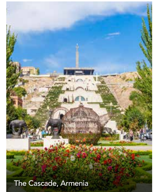
The Cascade, Armenia