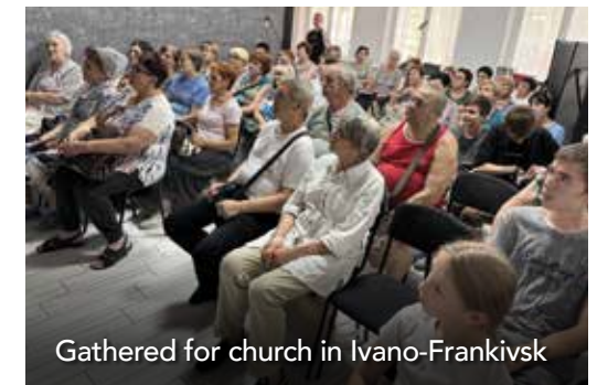
Gathered for church in Ivano-Frankivsk