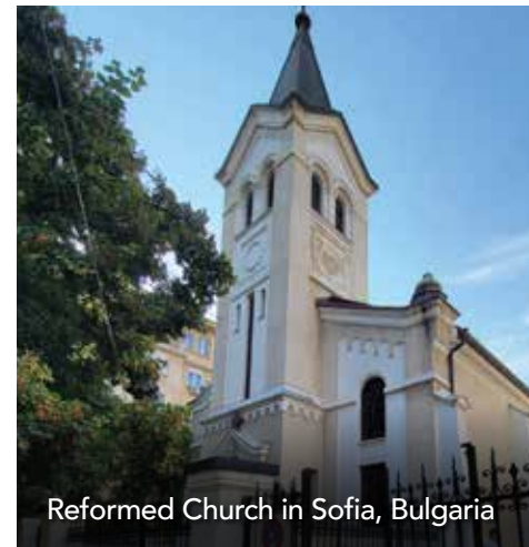
Reformed Church in Sofia, Bulgaria