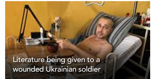
Literature being given to a wounded Ukrainian soldier

However, I am very grateful for Light of the Resurrection mission that distributes sound spiritual literature, especially in these challenging times. I found support and comfort in Paul Tripp's books. This author not only shares profound thoughts about grace but also honestly talks about his own mistakes and lessons. Tripp's books have become a source of strength and confidence for me during these difficult times. Especially helpful to me were Dangerous Calling and New Morning Mercies . These works not only strengthened my faith but also taught me to be more sensitive and compassionate in my ministry. They support me in my preaching and service, reinforcing my confidence in