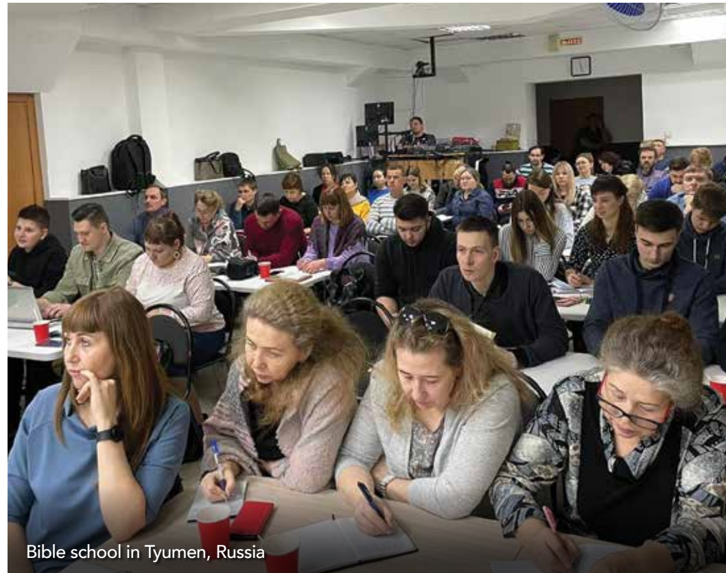
Bible school in Tyumen, Russia

The Charles Simeon Trust, which develops the abilities of pastors and Bible teachers to faithfully exposit Scripture, is conducting 4-day intensive workshops. Over 40 men participated last year!