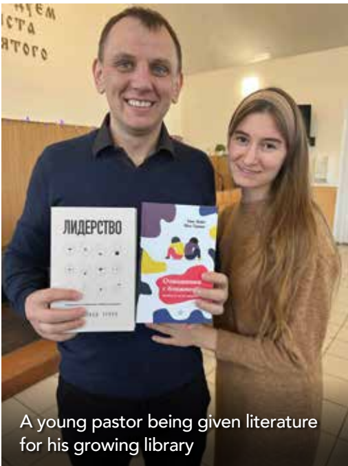
A young pastor being given literature for his growing library