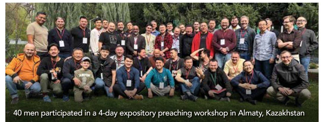
40 men participated in a 4-day expository preaching workshop in Almaty, Kazakhstan