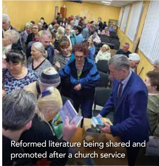
Reformed literature being shared and promoted after a church service

both physically and spiritually. Our activities do not stop there. We conduct evangelistic events using illustrations and distribute food and books to those in need. We also travel to partner churches and participate in conferences.