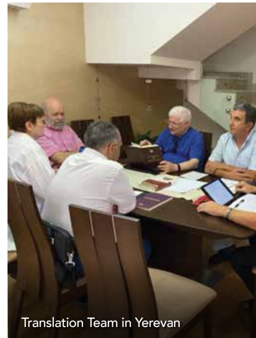
Translation Team in Yerevan