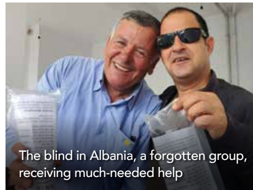
The blind in Albania, a forgotten group, receiving much-needed help

Parcels contained basic food items such as pasta, flour, tomato sauce, sugar, and so on, as well as basic cleaning products such as soap, washing up liquid, and washing