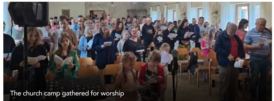
The church camp gathered for worship