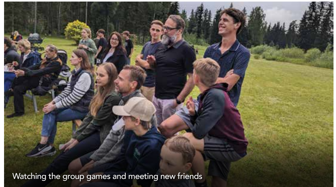
Watching the group games and meeting new friends

As a family, we joined in on camp activities. On Sunday evening, a challenging Bible quiz took place with all campers participating. It also happened to be Summer Solstice, the longest day of the year, with the sun not setting until after midnight and then rising again at 3:00 am. With celebrations taking place across Latvia, here at Church Camp they put on a feast with different cheeses, and dips garnished with dill and wild herbs.