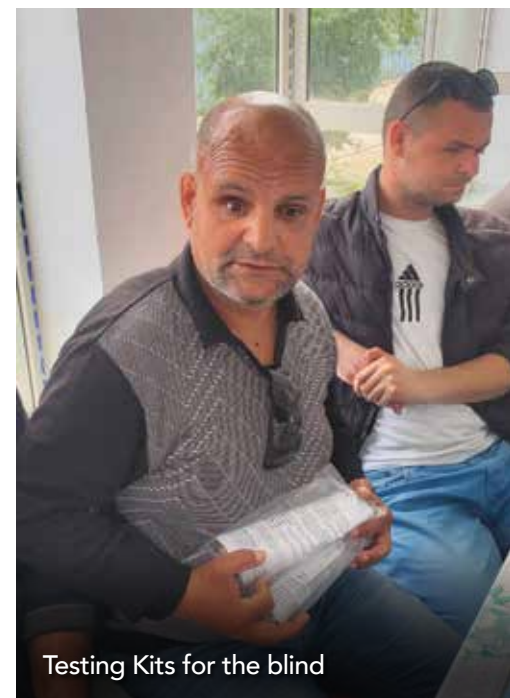
Testing Kits for the blind

We have purchased small quantities of equipment for testing among the blind. We have distributed talking watches, thermometers, and blood